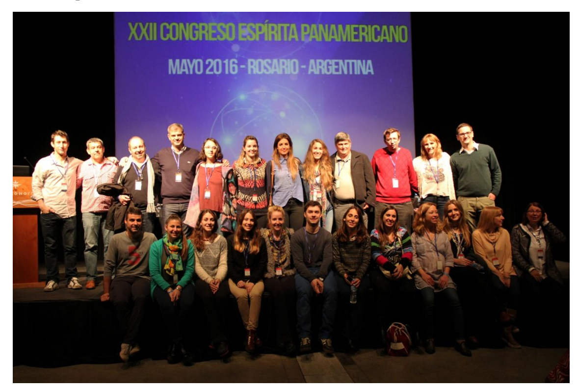
Figura 10rganizing committee

for the four-year period 2004 to 2008, being succeeded by the Argentine Dante López, who also remained for two terms.